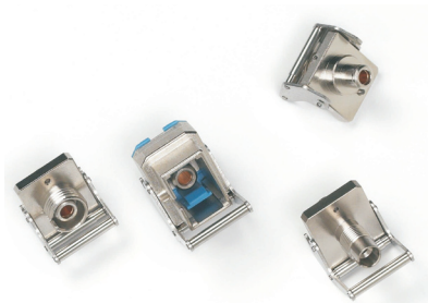
Optical adapters (BN 2150) for laser source output